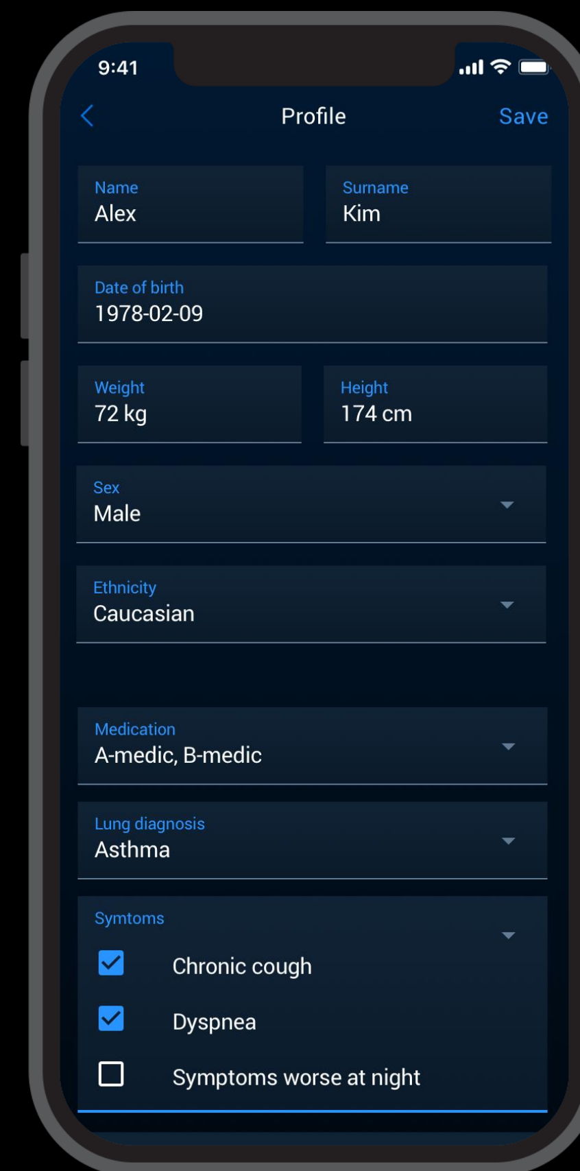
Patient demographics including symptoms and smoking history